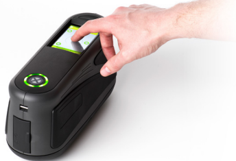
Intuitive touch screen makes measurement easy