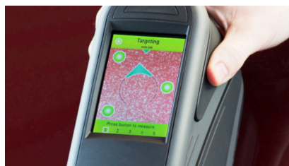
Live preview ensures accurate targeting